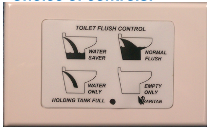
Smart Toilet Control