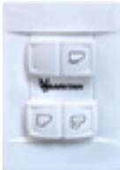
Multifunction Flush Panel