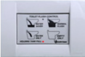
Smart Toilet Control STC